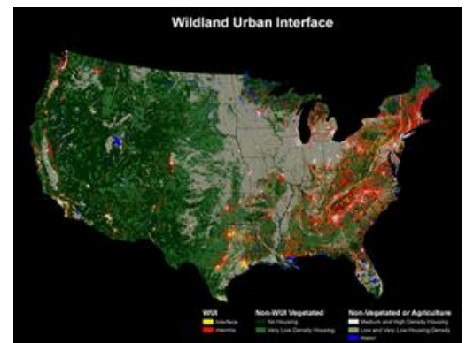
Wildland Urban Interface