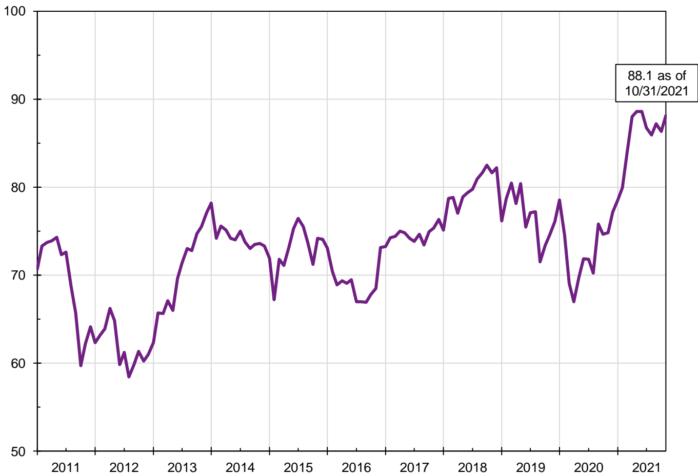
Willis Towers Watson Pension Index

The Willis Towers Watson Pension Index started the third quarter on a positive note, rebounding to levels last seen in the first half of 2021. This increase was primarily a result of strong investment returns. The index level of 88.1 reflects an increase of 2.1% for October.