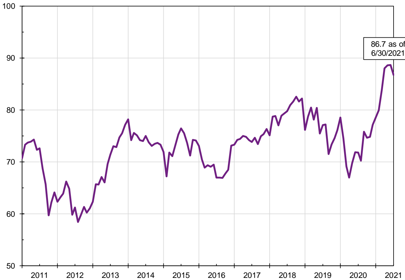
Willis Towers Watson Pension Index

The Willis Towers Watson Pension Index ended the quarter with the first drop of the year as liability increases outweighed positive investment returns. The end-of-June index level of 86.7 reflects a decrease of 2.1% for the month.