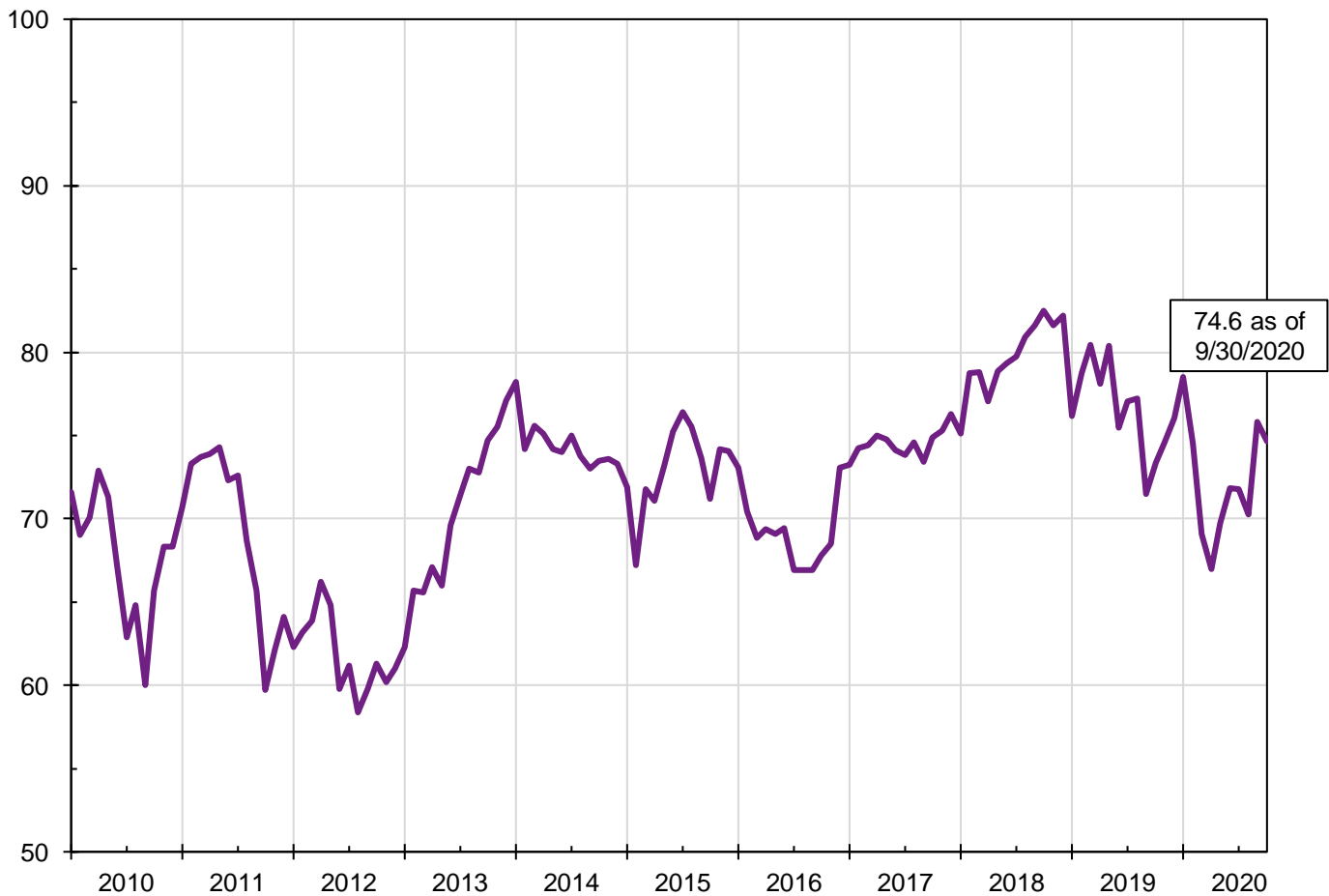
Willis Towers Watson Pension Index

The Willis Towers Watson Pension Index lost ground in September; the month's asset losses outweighed its liability decreases. The resulting 1.6% monthly decrease brings the index level down to 74.6, which nonetheless represents a 4 percent increase for the third quarter.