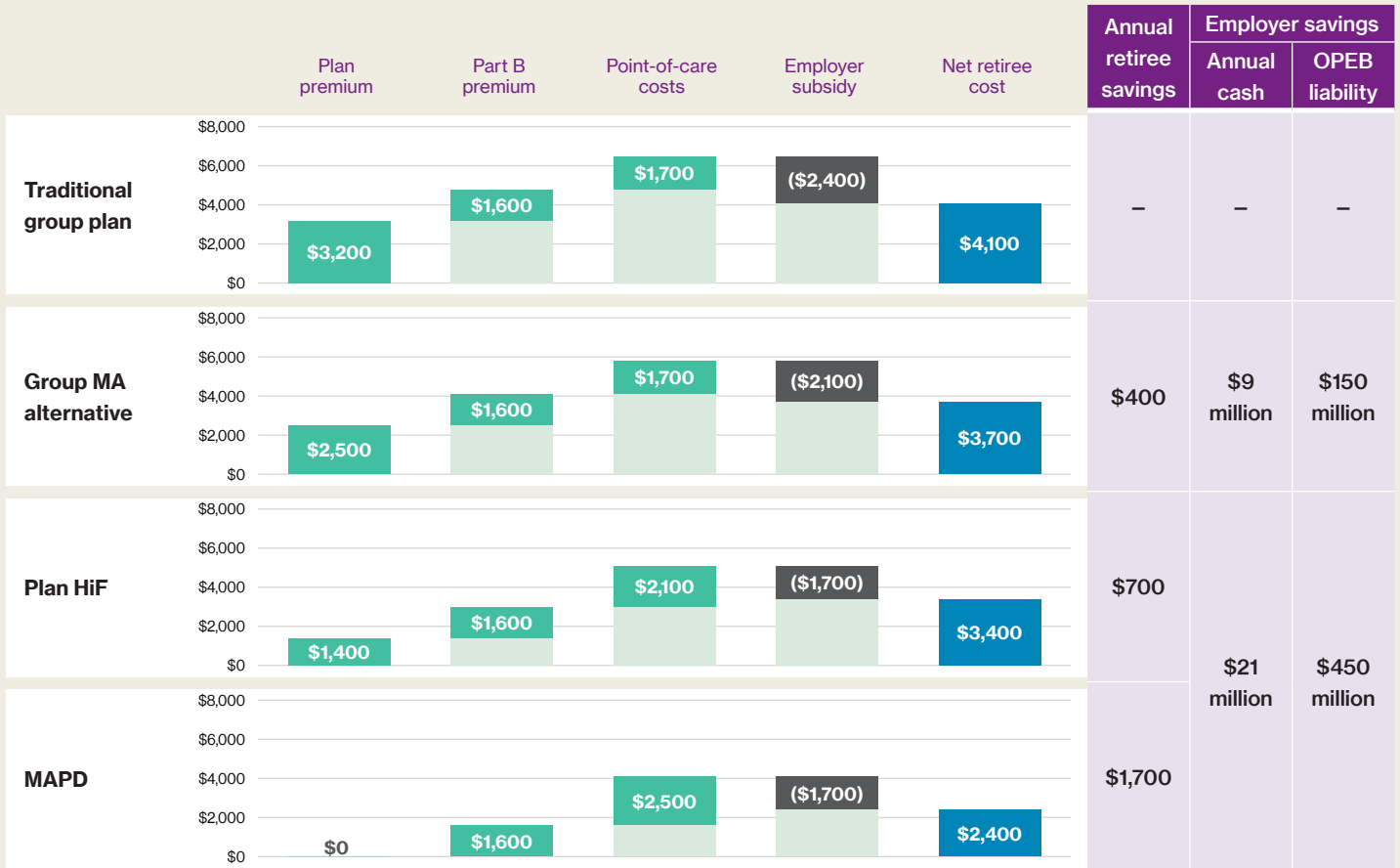
Figure 4. Midwestern retirement system: Average retiree savings with 70% plan sponsor subsidy